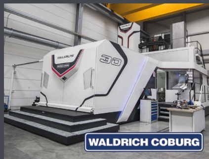
Coburg, Germany WALDRICH COBURG GmbH