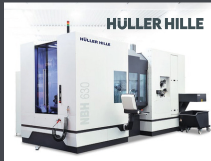
Mosbach, Germany HÜLLER HILLE GmbH