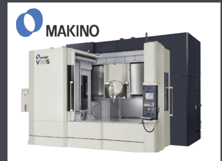
Kirchheim unter Teck, Germany MAKINO EUROPE GmbH