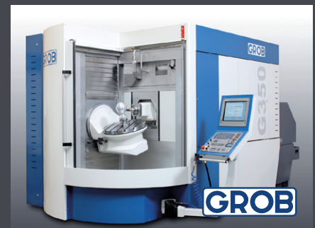
Mindelheim, Germany GROB-WERKE GmbH & Co. KG