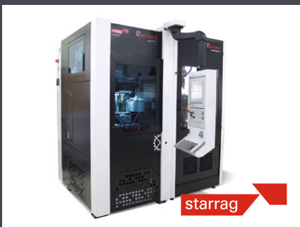
Chemnitz, Germany STARRAG GmbH